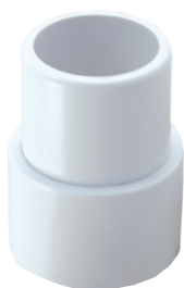
1.5" FITTING EXTENDER 21182-150-000

Continuing our commitment to offer the products that the professional really needs, CMP is the only manufacturer offering a true 2" socket fitting extender.