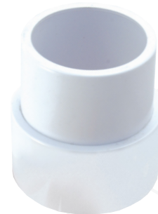
2.5" FITTING EXTENDER 21182-250-000