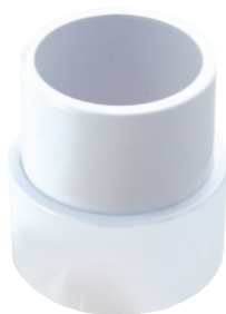
2" FITTING EXTENDER 21182-200-000