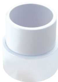
2" SOCKET FITTING EXTENDER 21182-220-000